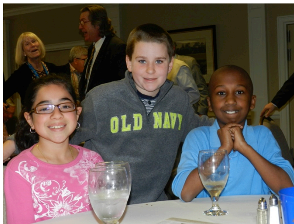
Three Rotary Readers students from East Aiken School for the Arts

Thank you to all Rotarians participating in this program. It is making a difference!